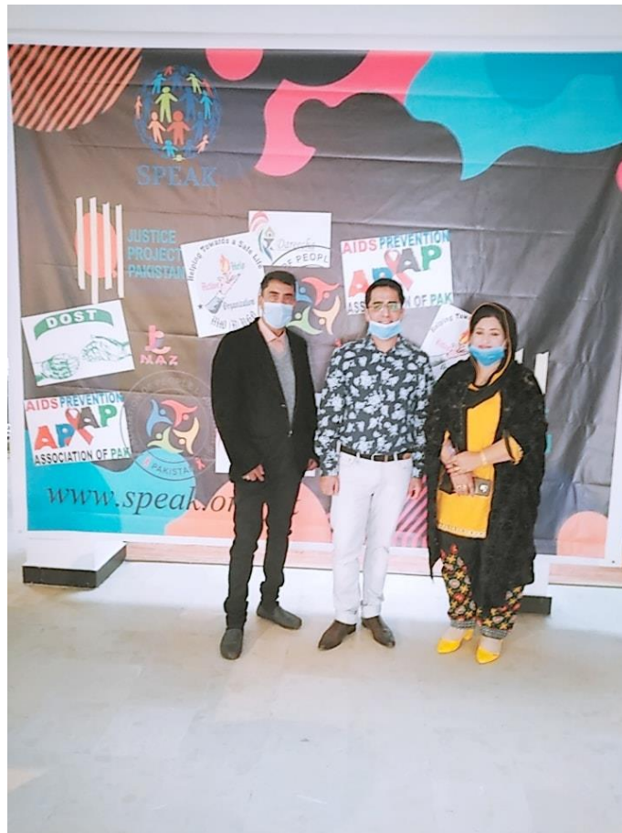
Figure 5 Meeting on HIV /AIDS with Govt Stake Holders

The overall management of the grant specifically in terms of reaching the targets has been splendid considering the amount of time. On the other hand performance in terms of utilizing more budget to its maximum level could be improved if external factors would have been spared.