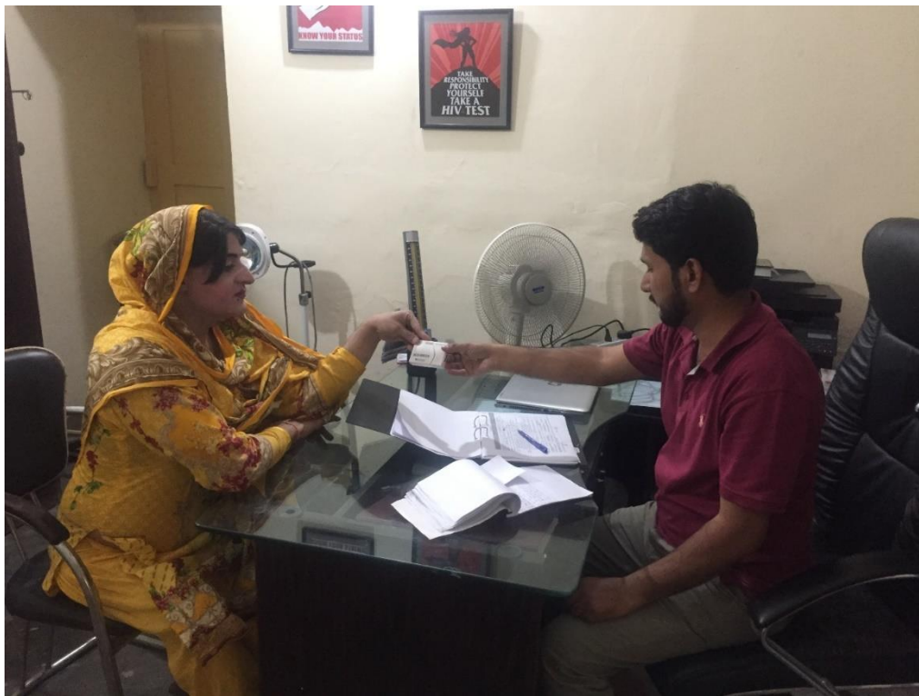
Figure 4 Volunteer Testing & Treatments

This is the main highlight of the experience Dareecha had in implementing KP/TG focused HIV program.