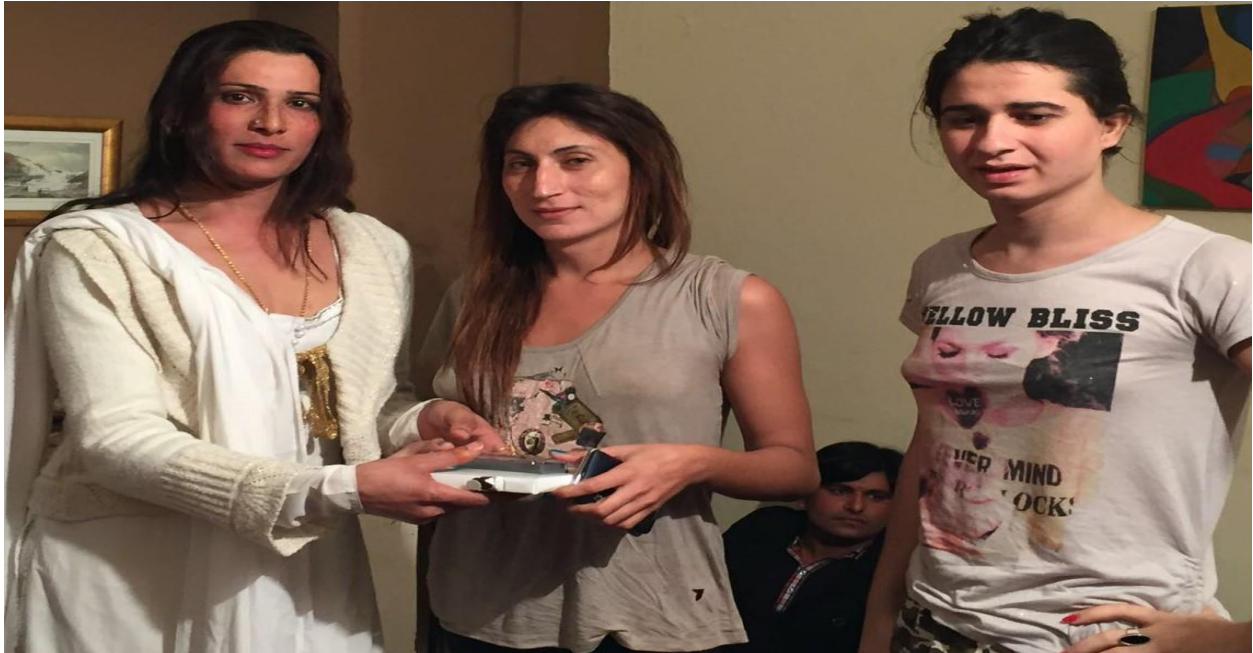
Figure 6 Initiative by the community organization to upfront community for the communities working on the grass root level.

Dareecha has always received positive feedback whether it be community or stakeholders. Community has always been concerned regarding the continuation of the grant and their participation has been very helpful in terms of referring other clients, creating awareness among their friends or working with Dareecha as peer educators. Most of the clients in their own language has admired Dareecha saying, “We did not know anything regarding our health issues before Dareecha. Dareecha has opened up our minds. Other have said, “We do not get fooled by our clients during sex work- we know that our health is more important than their money”. Now since the grant is ending, they are concerned about where will they go in the future as they don’t feel comfortable going anywhere else.