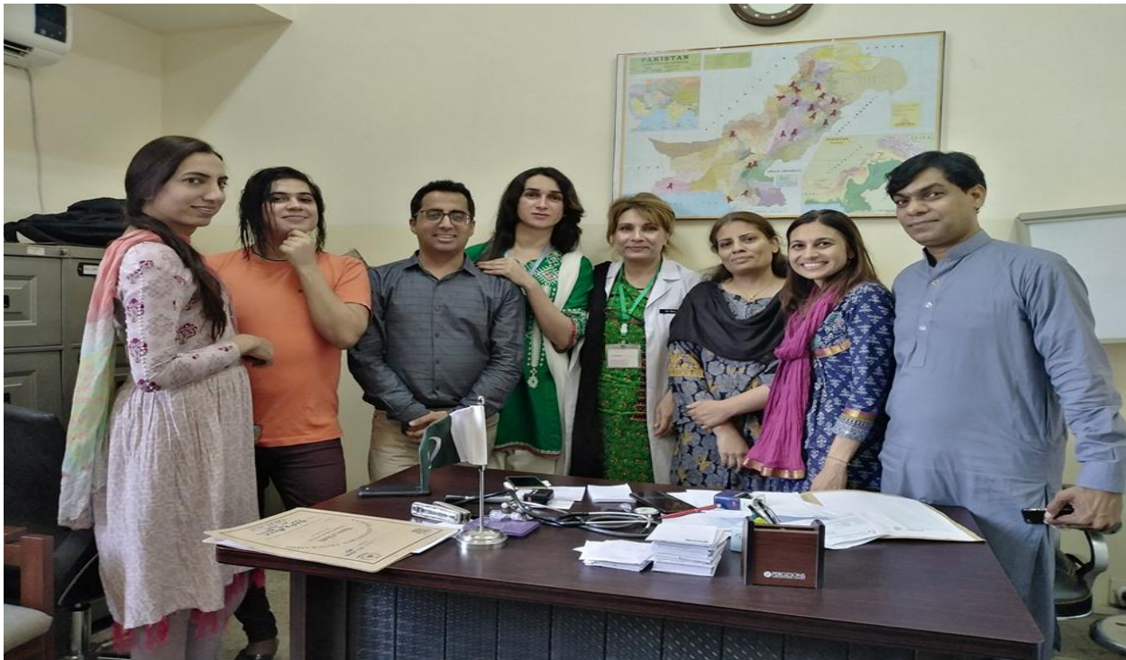
Figure 1 Team Dareecha along Clients at PIMS

Therefore, DMHS is one of its own kind which has been successfully providing awareness platforms to the Transgender community members to have a better and healthy lifestyle. Dareecha Male Health Society has its secretariat office functional in Satellite town, Rawalpindi, Pakistan. DMHS has been working majorly in liaison with National Aids Control Program of Pakistan in order to achieve HIV/AIDS prevention objectives and targets. Various International and Local organizations have assisted DMHS ever since it has been founded. Moreover, DMHS aims to work on having a wholesome, well aware and socially inclusive Transgender community in Rawalpindi region.