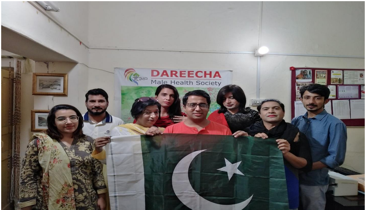
Figure 2 Team Dareecha along community at Pakistan Day

Dareecha envisions a world, an Asia, a Pakistan and a Rawalpindi, where individuals are able to exercise their fundamental human rights for the achievement of personal and professional excellence, regardless of their sexual orientation, sexual behavior, and gender identity.