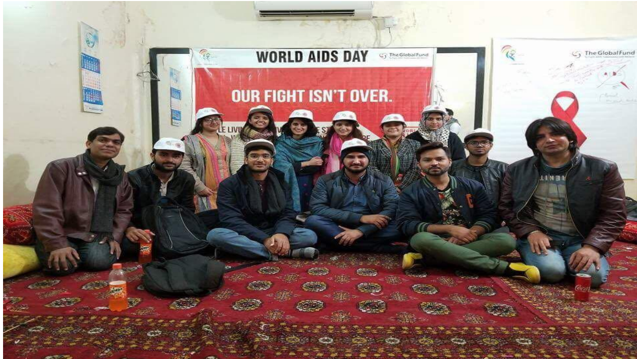
Figure 3 Observing World AIDS Day at Dareecha with University Students

Dareecha Male Health Society's goal is to achieve a healthy and conducive social and legal environment in Rawalpindi for the betterment of Transgenders & Key Populations.